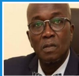
Falou Samb Republic of Senegal